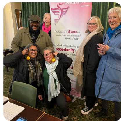
Our MiB Quizzers had a great night!

Last month a local gardener advertised manure for sale in this Newsletter. She was pleased to report that very quickly, all 20 bags were sold. If you have plants or garden-related materials to sell or give away, think about advertising in the Blooming News. It works!