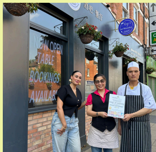
MAY'S AT MOSELEY