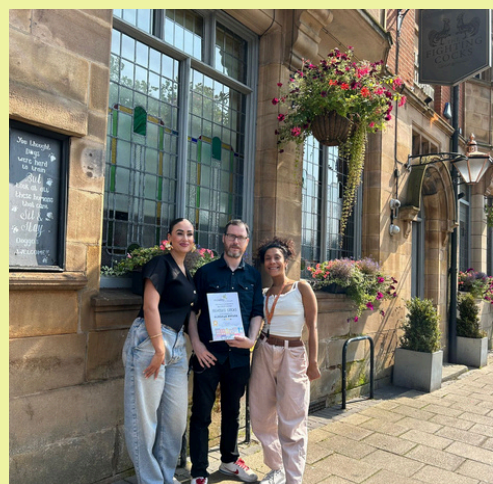
THE FIGHTING COCKS