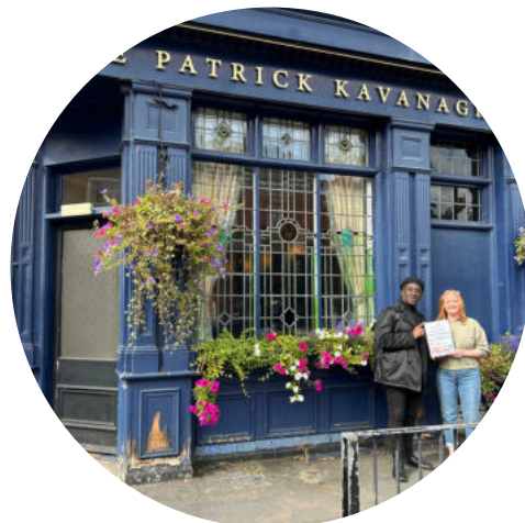
Patrick Kavanagh MOST BLOOMING BOOZER