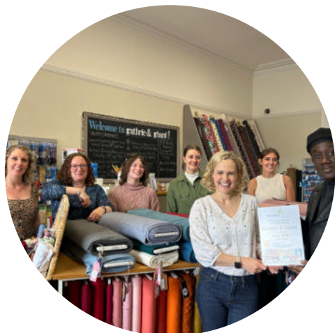
Guthrie & Garni STAR SHOP