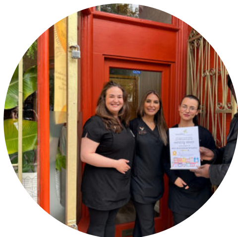
Moseley Haven MOST BLOSSOMING BUSINESS