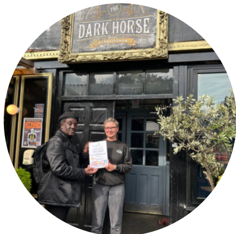
Dark Horse MOST BLOOMING BOOZER