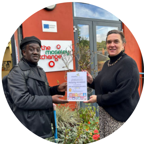
Moseley Exchange MOST BLOSSOMING BUSINESS