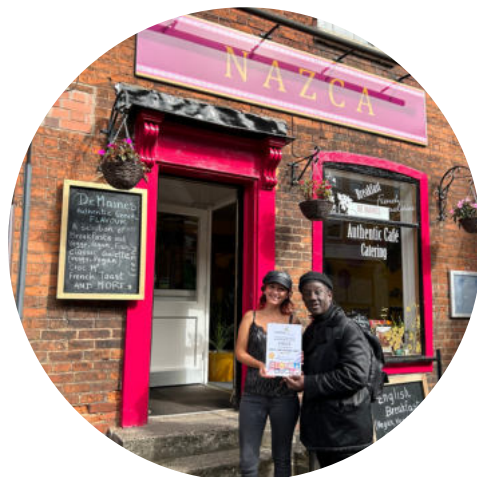
Nazca MOST CAPTIVATING CAFE