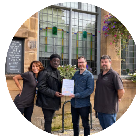
Fighting Cocks MOST BLOOMING BOOZER