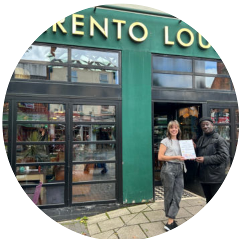
Sorrento Lounge MOST CAPTIVATING CAFE