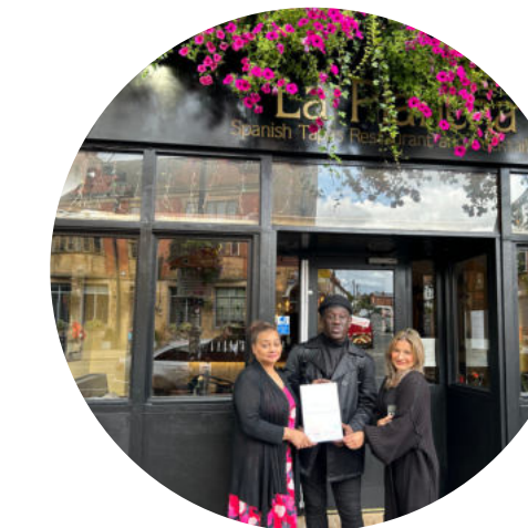
La Plancha SPECIAL ACHIEVEMENT